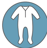
SLEEPERS (newborn - 12 months)