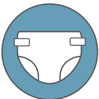
DIAPERS + WIPES (size newborn - 5)