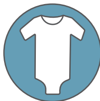
ONESIES (newborn - 12 months)